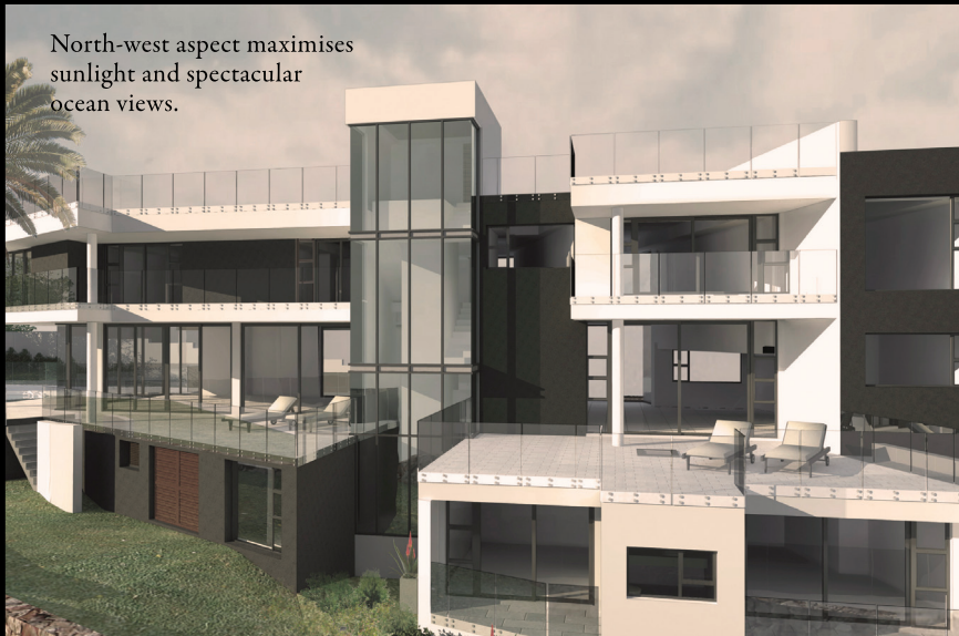
North-west aspect maximises sunlight and spectacular ocean views.